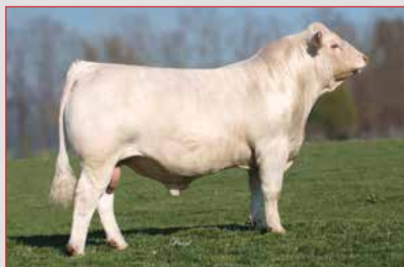
Mead RF X-Factor

• Here is the only X-Factor bred heifer we have in the sale offering so take advantage and find out just how good these daughters are in production. Her pedigree contains so many of our breeds finest like Wyoming Wind, Duke 914, OW Ashlee, Cigar, Ms Commander B309 and Impressive D040 and bred to calve with one of the first calves by Resource. A full sister sold two years ago for $5,500 and a full sister sold last year for $4,000. There is consistency and profit in these genetics.