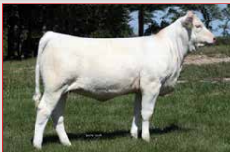
Summit Ms IA Wind Y13