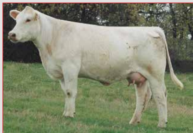
M6 Ms E46'S Duke 248