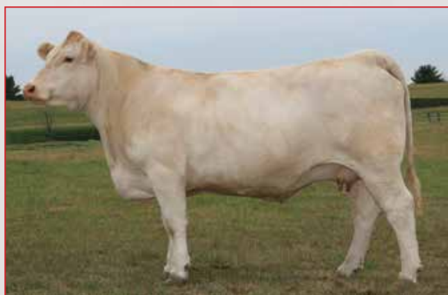
WCCC Ms Wind 448 ET - Dam of Lot 58