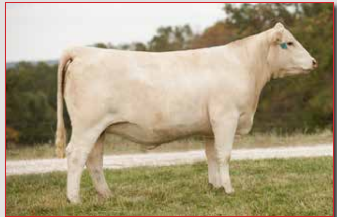
WC RF WIA Ms Turbo 187A - Sold in 2014 Ridder Farms Sale at $12,000

• Presented by Ridder Farms, Wright Charolais & Wild Indian Acres