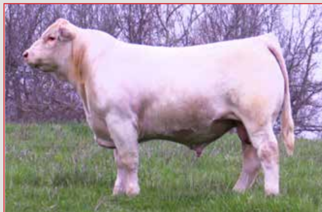
RF Ledger 439