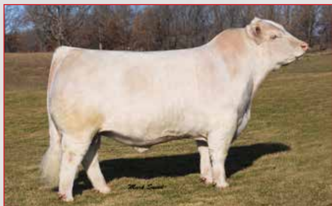
Keys All State 149X

The following Foglesong Charolais Lots 40 through 49 were pasture exposed to multiple purebred herd sires including mainly the two reference sires on the following page; Southern Gridmaker 05200 & Southern Easy Pro 01395. These ten (10) cows were pasture exposed to those two herd sires for the first 30 days of the breeding season in the summer of 2015 from June 10, 2015 to July 10, 2015. After that time, these ten cows were then pasture exposed to more multiple sires. All of the pasture sires have DNA on file at AICA and parentage verification will be determined when these calves are born. Presented by Foglesong Charolais, Drew Foglesong, Ipava, Illinois 309-221-1439