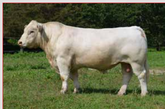
NS SCF All American - Service Sire for Lot 29