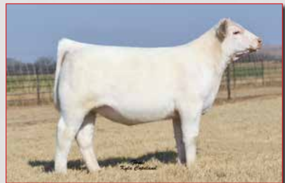
Pembroke - Daughter of Lot 68