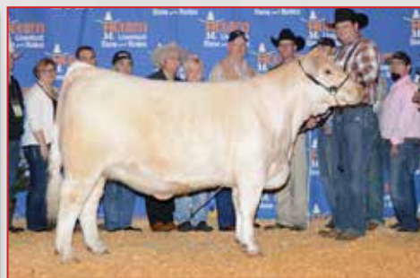
WC RF WIA Ms Turbo 3401 Sold in 2013 Wright Charolais Sale for $6,500