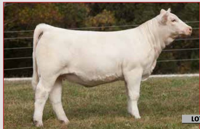
RF BOCEPHUS 5027