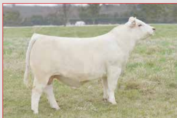
CCC-WC Resource 417 - Service Sire to many Ridder Farms lots