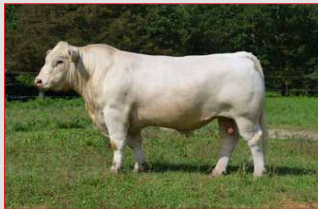
NS SCF RLL All American 13010 E