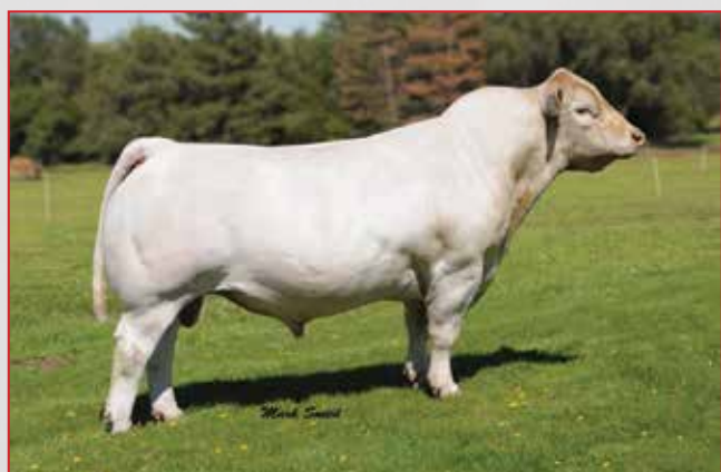
TR PZC Fire Water 5792RET