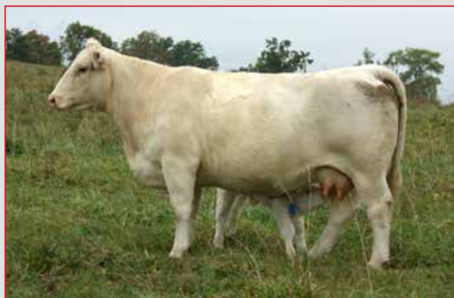
Lot 67 - Taken this past summer