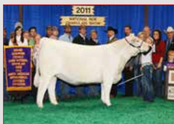
TR PZC Ivory Angel