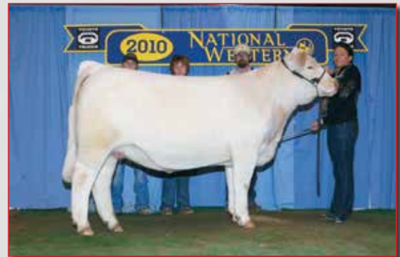
Ultraviolet - Full Sister of Lot 68