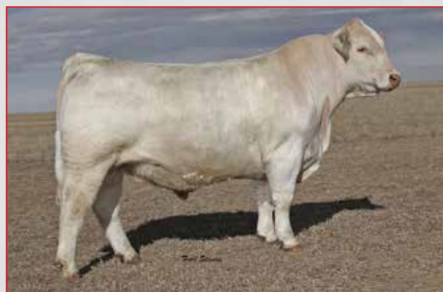
LT Rio Bravo 3181 P

•LOT 63A - Polled heifer calf, born: 8-27-15