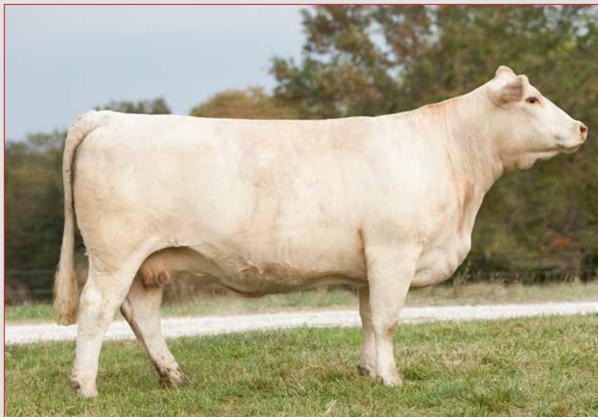
M&M Ms Stealth 7515 Pld ET