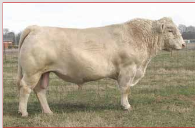
LT Easy Pro 1158

•LOT 65A - Polled bull calf, born: 9-21-15.