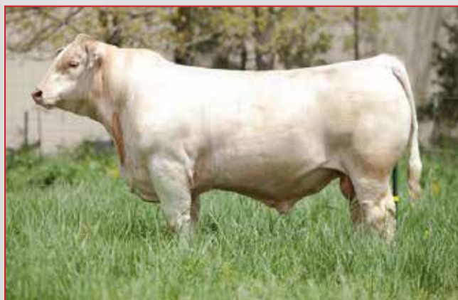
LT Investment 2292 Pld - Sire of Lots 21A & 22