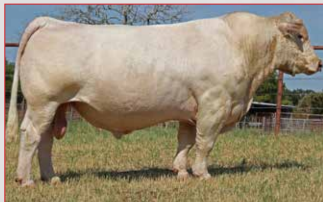
M6 Cool Rep 8108 ET

•LOT 62A - Polled heifer calf, born: 9-13-15.