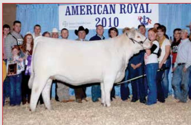
TR PZC Firegirl 9745W ET