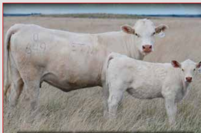
Eatons Miss Busby 00649 Poll- Dam of Lot 56