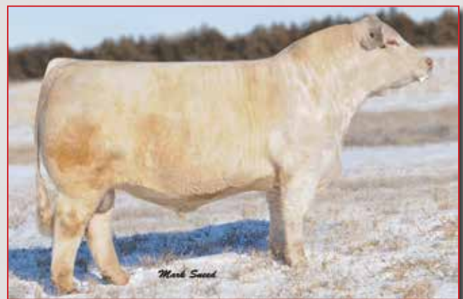
TR PZC Rapid Fire