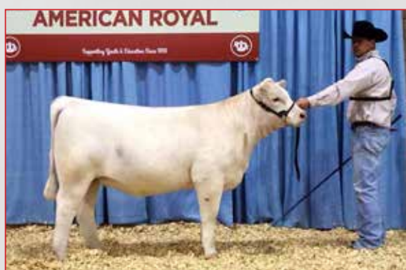
RF Southern Spice 402 - Granddaughter of Lot 27 sold in Ridder Farms Sale 2014 at $7,000