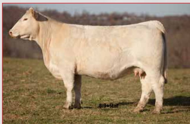
LT Blue Ballerina 9405