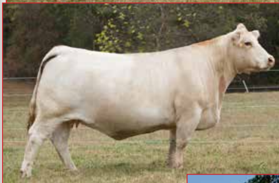
Creek Cut Greta 576