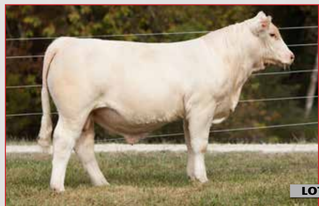
SELLING 3 IVF EMBRYOS

• MCF Bohannon x M&M Ms Stealth 7515 Pld ET • These are full sibs to Lots 3, 4 & 5.