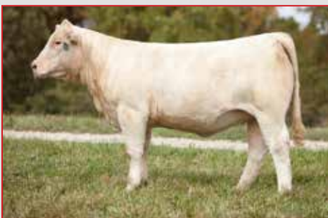
RF WC WIA MS Turbo 295A Sold in 2013 Ridder Farms Sale at $5,750

This will be an IVF flush, guaranteed to produce at least 6 embryos.