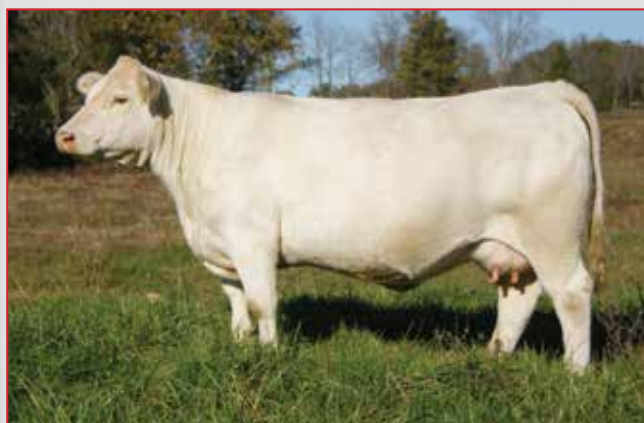
OW Ashlee 0063 P ET