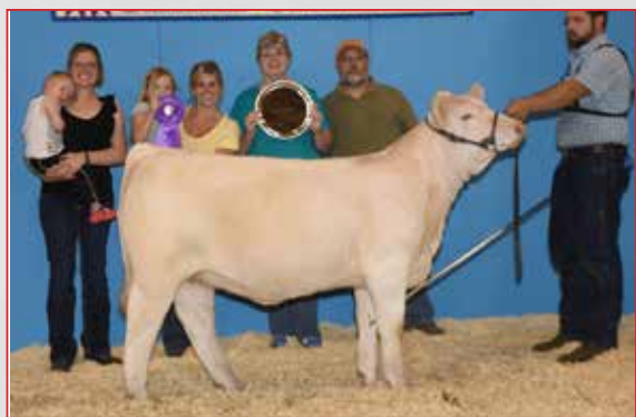
3/4 sister to Lot 12 sold for $9,000