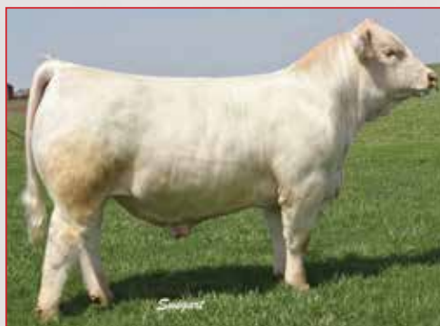
TCCS INXS's No Doubt