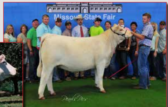
RF Greta 96Z

• When thinking of Family Values and what great cow families can do for someone's operation, the Greta cow family comes to the front of my mind real quick. This daughter of Greta sired by Ledger will be a front pasture donor after her show days are over. Just like all the Greta calves this one also has all the center body and rib shape that one could ask for. She is a maternal sib to RF Greta 96Z, a past sale topper at $10,000 and was the 2013 Missouri State Fair Champion Female for C&H Farms. After having seen the kind of cow she made for C&H and seeing what other daughters have done I believe this is one of those can't miss cow families that is going to be a big part of our operation moving forward. It's truly unique to have this phenomenal pedigree and achieve her elite quality look! Buy with confidence. Entered in Louisville.