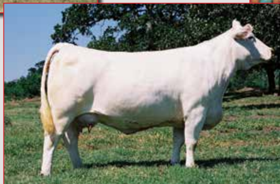
RLL Goin' Places 1329PET