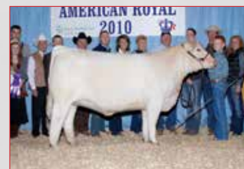
PZC TR Bomshell