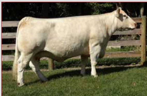
SFC Babe 304