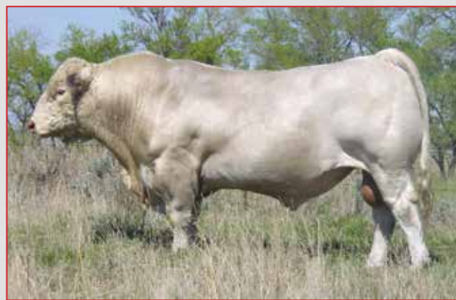
M6 Grid Maker 104 P ET

•LOT 64A - Polled bull calf, born: 9-22-15.