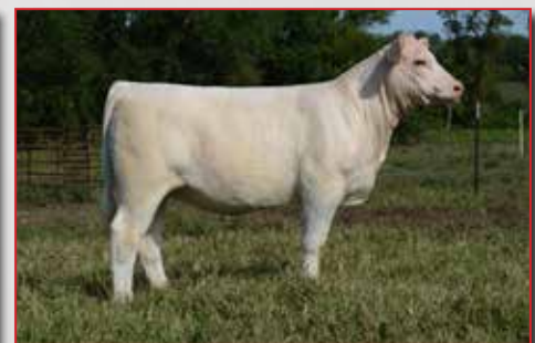
WC RF WIA Ms Turbo 3402 Sold in 2013 Ten Grand Sale for $7,500