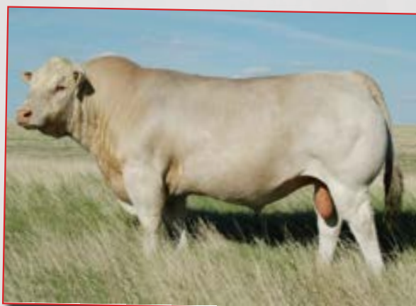
LT Ledger 0332 P - Service sire to Lots 29, 30, 31 & 32

308 is sired by the Multiple Trait Leader Field Rep and out of a nice Wyoming Wind daughter. We have sold two sons into commercial herds in Florida and Oklahoma. A female with solid numbers that will only increase in value with her Ledger calf at side.