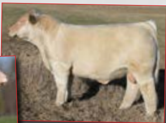
MCF Bohannon 305A