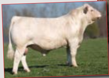
Mead-RF X-Factor G584 P

These embryos are full sibs to $10,000 RF Ms Duchess 202 P.