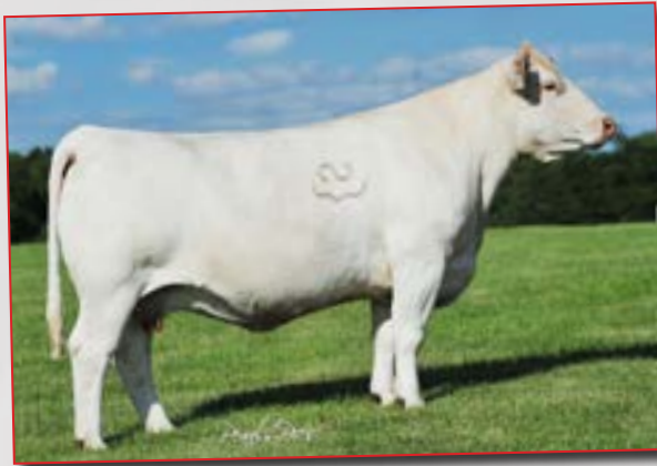
SCR Ms Turbo 7003 - Dam of Lot 25 Choice & Lot 26