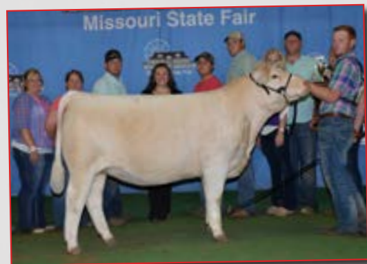
2014 Missouri State Fair Grand Champion Female-Her dam a Ridder Farms bred dam- RF Cassi 538 P