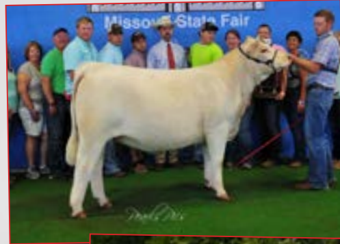
RF Greta 96Z

M6 GRID MAKER 104 PET M633377 WCR SIR TRADITION 066 WCR SIR TRADITION 4402 IDEAL 809 45 OF 25 VCR MISS MAC IV 317 WCR SIR FA MAC 2244 WCR SIR FA MAC 2244 VCR MISS DUCHESS 113 PLD RLL GOIN' PLACES 1329PET F950190 WCR SIR FAB MAC 809 VCR MISSPERFECTION0119PD WCR MISS CENTURY 920 TWN WCR SIR PERFECTION 829 73ACR MS PATSY W/152 CE BW WW YW Milk MCE Mtnl SC EPDs: 11.9 -4.0 19 46 12 7.7 22 0.5