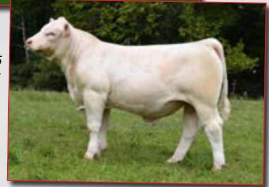
RF Excel 427

Presented by Ridder Farms, Wild Indian Acres and C&H Farms