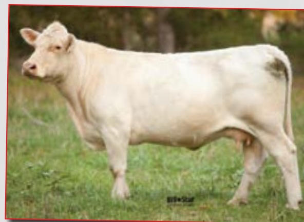
Dam of Lot 32

This female is out of the 3070 donor that Suttles Charolais added to their herd through this sale a couple of years ago. 3070 is a full sib to the 2419 donor for Polzin, both daughters of the great donor RC Ms Bud 418, the full sister to RC Budsmydad. 696A is a stout, rugged, massive bodied type of female. Outstanding pedigree and bred to an outstanding bull.