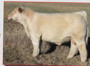
MCF Bohannon 305A