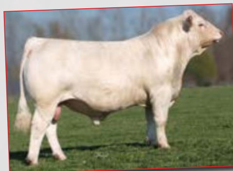
Mead-RF X-Factor G584 P - Grandsire of Lots 3 & 4 and sire of Lots 6 & 7.