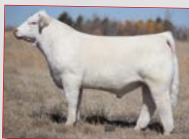
KASS/ CJB Quiet Riot ET

Quiet Riot is the 2012 Denver Reserve Grand Champion Bull. This pedigree doesn't need an introduction for followers of the Charolais breed.