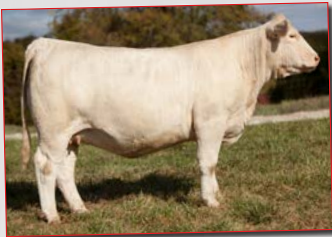
RF Ms Duchess 202 P - $10,000 Daughter of RF Ms Duchess 030 P