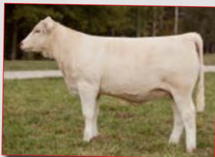
Full sister to Lot 24A