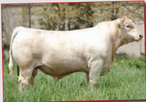
LT Investment-Service sire to Lots 33, 34 & 36