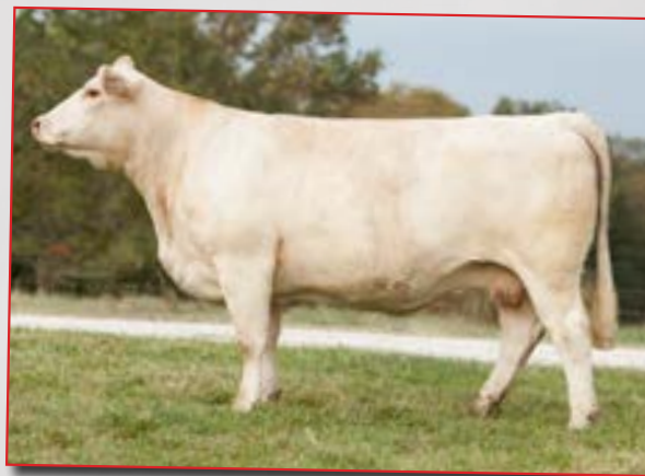
M&M Ms Stealth 7515 Pld ET