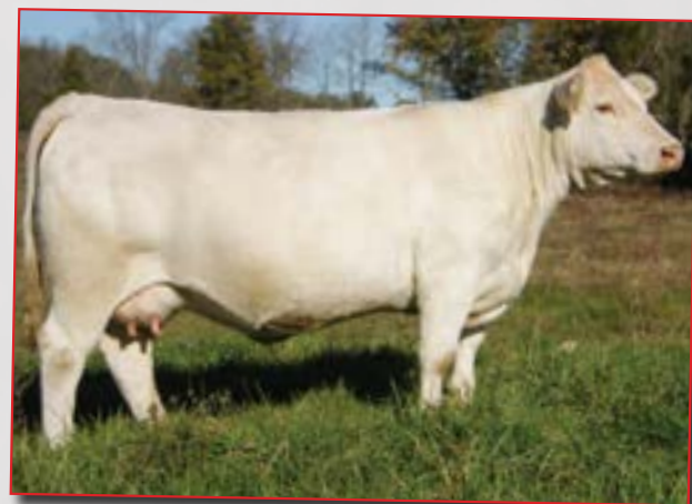
OW Ashlee 0063 P ET - Dam of Lot 5