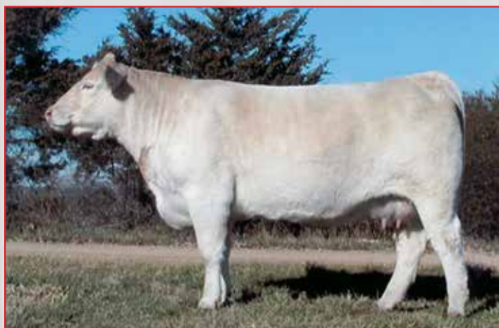
OW MISS MARION 0025 ET-GRAND DAM OF LOT 37