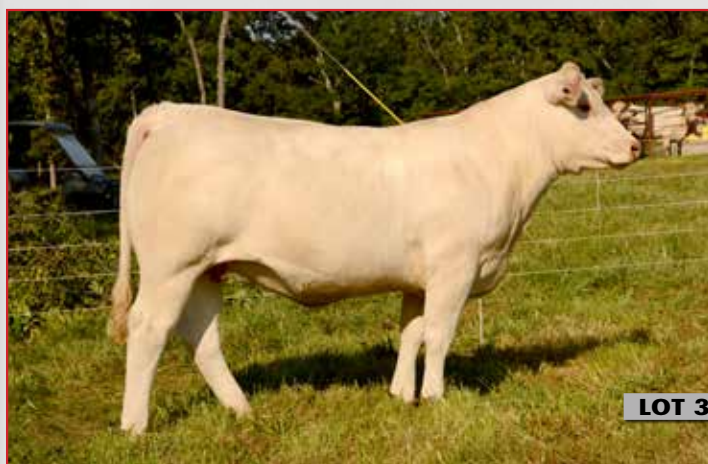
WIA RF BRONCO QUEEN P