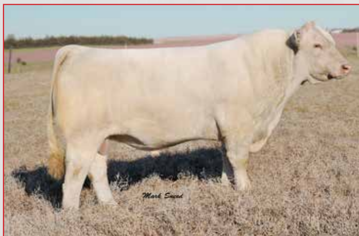
WR WRANGLER W601