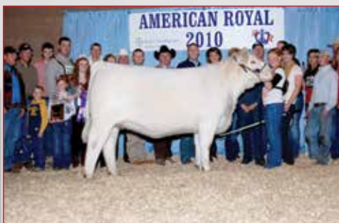
FULL SISTER TO LOT 16