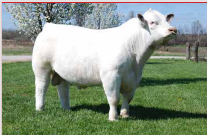
BIG CREEK GAME CHANGER-AI SERVICE SIRE FOR LOT 47