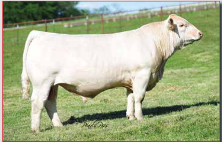
LT-WC TEMPLETON 1483-AI SIRE FOR LOT 51