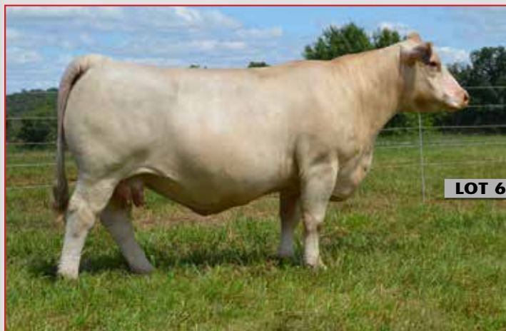
WC MICHELLE 9019 P