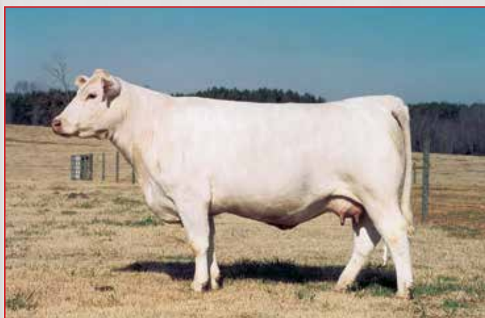
JWK CLARICE J139-DAM OF WC BENELLI