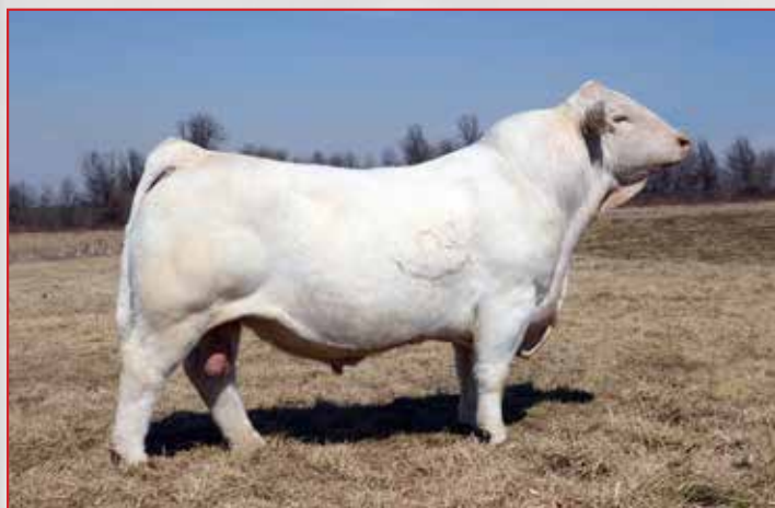
SCR BRONCO 9036-SIRE OF LOT 32