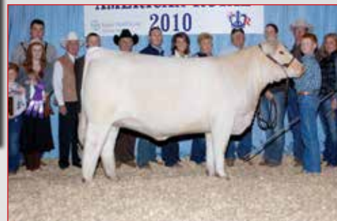
FULL SISTER TO LOT 16