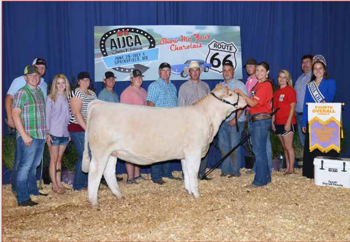
RF MS STEALTH 557-FLUSH IN HER DAM SELLS!