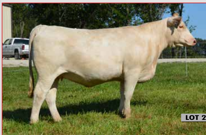
RF MS SOUTHERN SPICE 509