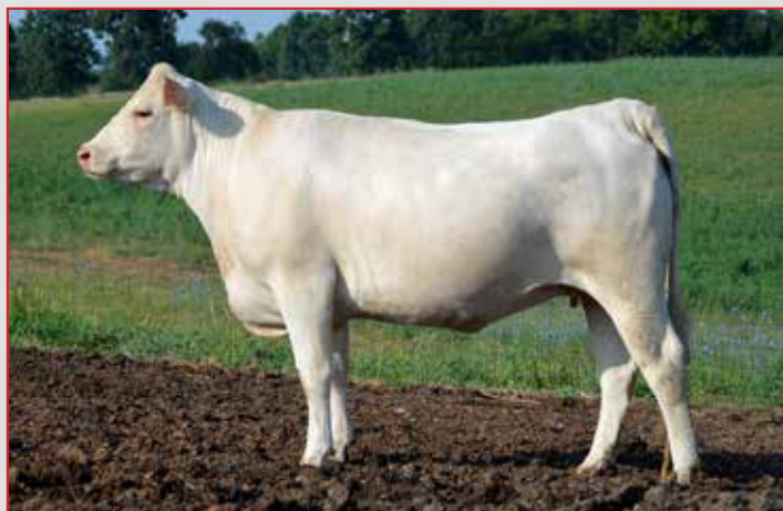
DAM OF LOT 29 - AS A BRED HEIFER