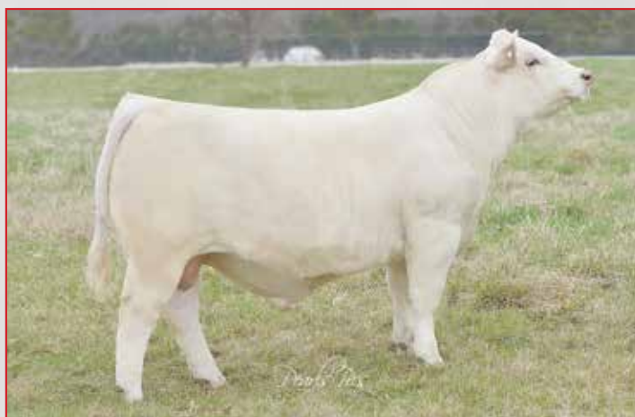
CCC WC RESOURCE 417 P-SIRE OF LOTS 12 & 13

• Here are the first calves out of the $44,000 half interest Resource that we have offered up for sale and to say we are excited about these things is an understatement! These two heifers are big bellied and correct in their structure. What really excites me is the way these two females come high out of their shoulder junction into their long goose frontends. A maternal sib to 633 sold as one of the better bred females a couple of years ago to JVS in Louisiana for $4500. 633 goes back to one of the longest lineages of cow families we have built around here and has produced a lot of great females. This will be the third year in a row that 636s dam has had an open heifer make the sale. Her dam 1043 has been very consistent with her calves. The last two sold into the Ahmann and Satterfield programs. I think these heifers are very similar in their type and kind and can go out and do big things in the show ring and in the pasture. A maternal sib to Lot 12 sells as Lot 22.