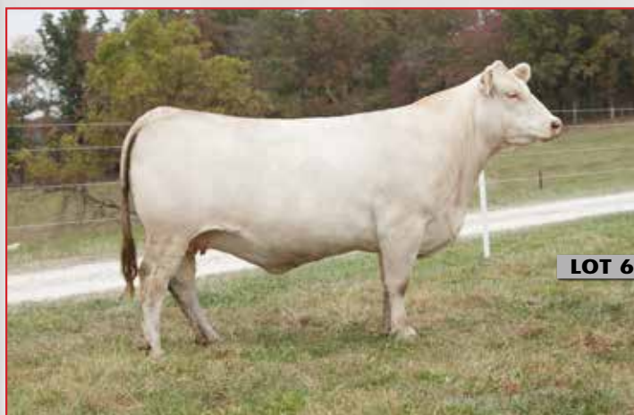
RF AGATHA 963 P