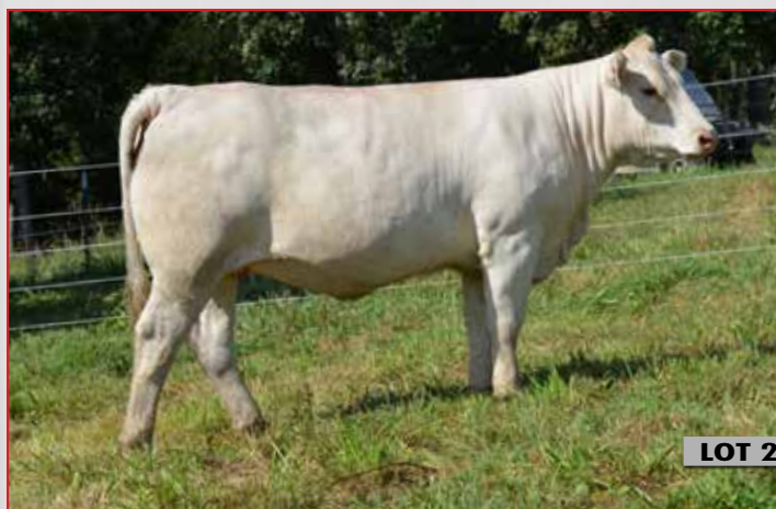
RF MS DUCHESS 5101 ET