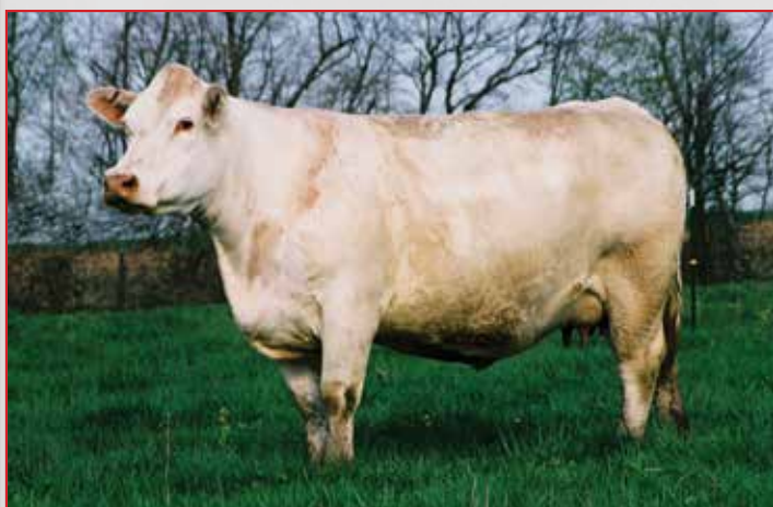
CREEK CUT CIGARRO 382PET