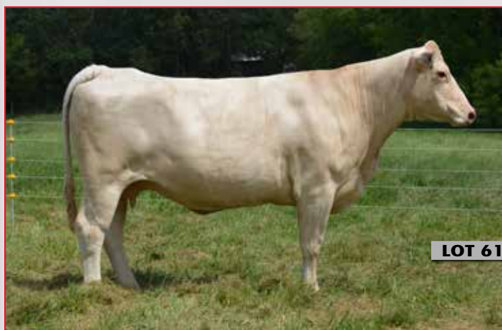
AC MS LIL LADY 908

•Presented by Ridder Farms & Wild Indian Acres