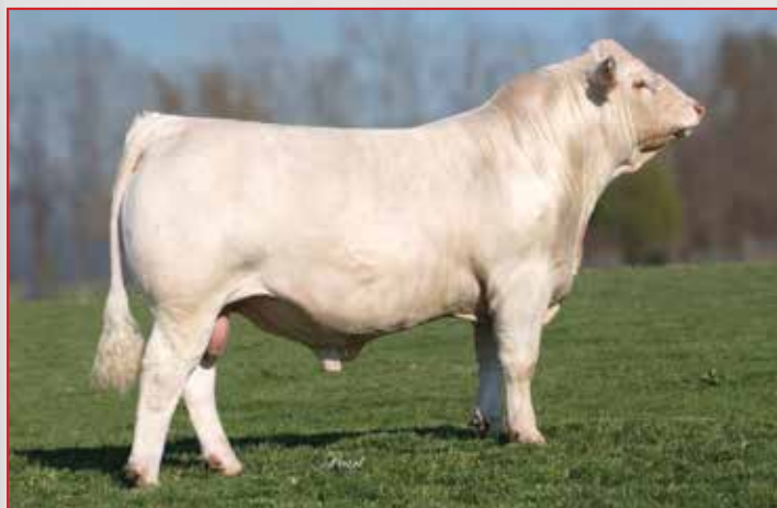
X-FACTOR- SIRE OF LOT 28