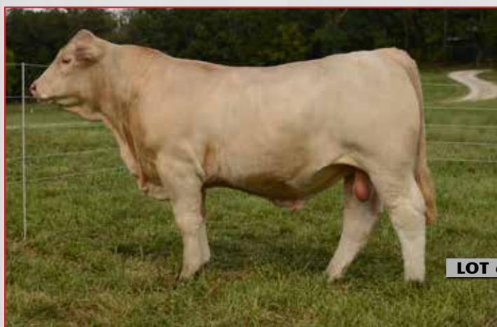
RF WIA OAK RIDGE 5224 ET