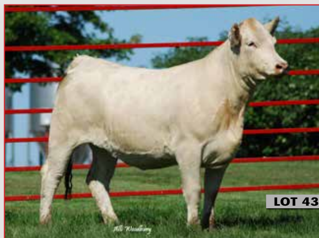
SUMMIT MS ENDURE C144