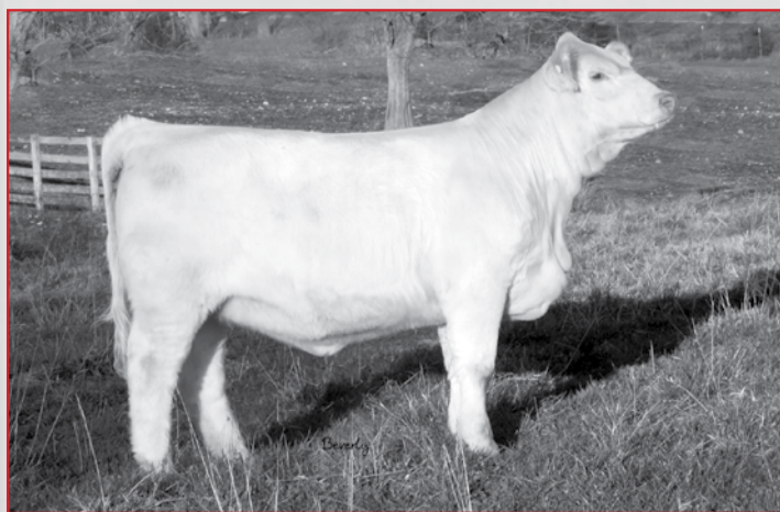
LOT 62 AS A WEANED HEIFER CALF

•Due to calve before sale day to MCF Bohannon 305A, with a heifer calf pregnancy. •Lot 62 #916 is a cow that has always been a favorite of mine and so was her dam who I had a lot of success showing. Ms Impressions is sired by Cooley Jordan and out of a daughter of the National Champion PF Impressed and she is a moderate made belly dragger. Originally she was going to be a sale feature open heifer (pictured) in our New Decade Sale in 2010 but right before the sale she badly sprained her front ankle and had to be removed from the sale. You can still tell she had an injury but it has never been an issue as far as how she gets around. We have bred this female both for club calves and purebreds. A son sold in the 2014 MCBA Fall Sale for $4,400. If you like 'em moderate and cool made you need to look at this cow and I imagine her Bohannon heifer calf will be pretty nice as well.