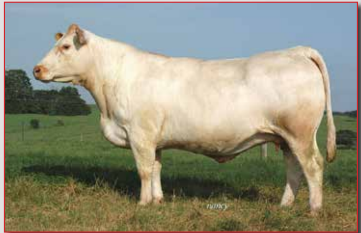
HOODOO MS GEORGE Z0116- DAM OF THE LOT 57 MATING