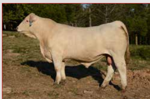
HER $9,000 SON