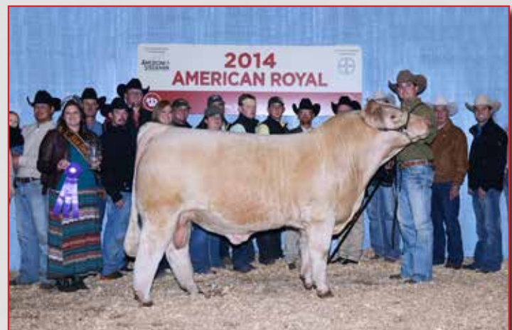
MCF BOHANNON 305A -NATIONAL CHAMPION BULL

M&M Ms Stealth 7515 has been a long standing donor for our operation for several years. Her calves continue to rise to the top of every sale we have. She is featured in the Lots 1 & 2 to start off this catalog. These two full sisters are no exception being sired by the National Champion Bohannon and out that great donor. A full sister was our high selling open female in last years Family Values Sale at $9000. These two heifers are also full sibs to RF Bocephus 5027. He is your current National Bull Calf Champion in Louisville as well as Calf Champion at the American Royal and in Denver and will be back out on the show road this fall. Mid Continent Farms sold a full sib to these heifers last fall for $7500. 6102 & 6108 are both younger than most of the sale offering of opens but are both correct, stout in their design and made nice up through their front one-third of their bodies.