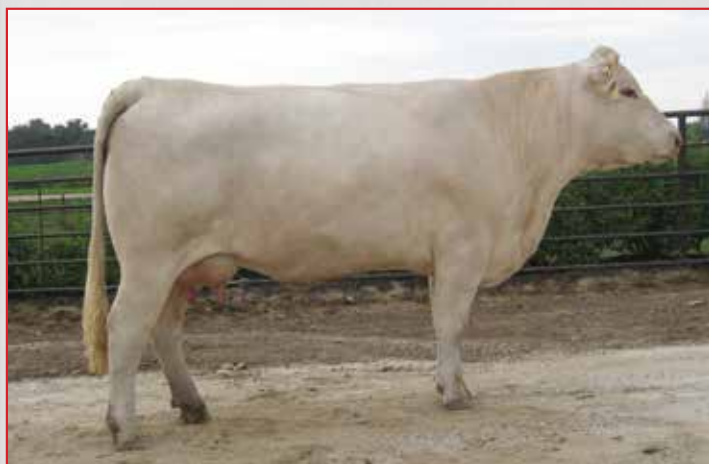
PR ENDURE 532-DAM OF LOTS 43 & 44