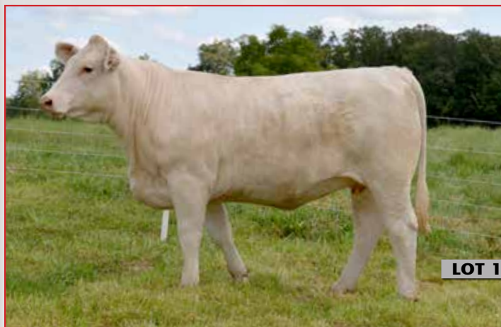
RF HANNA 504