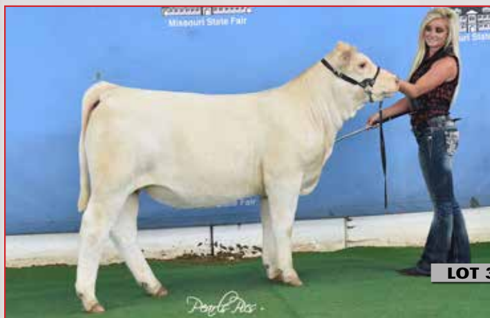
2016 MISSOURI STATE FAIR CALF CHAMPION