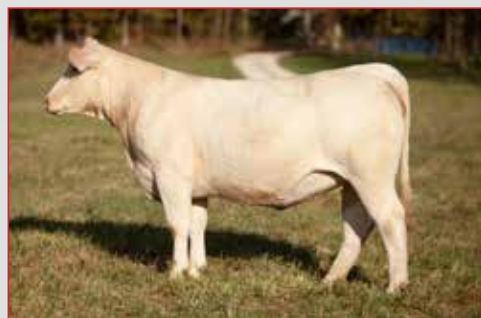
RF AGATHA 149P-DAUGHTER OF LOT 66