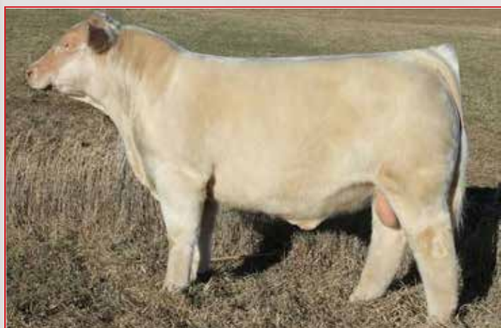
MCF BOHANNON 305A-AS A WEANED CALF!