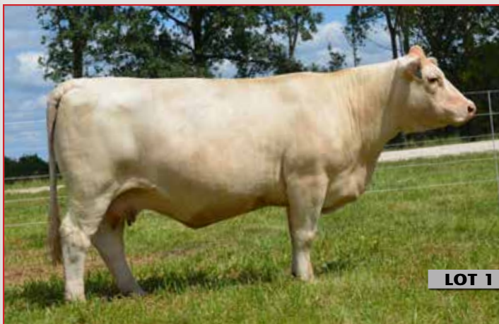
RF MS STEALTH 964 P