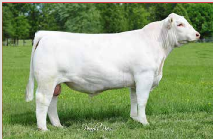
LT BLUE MOUNTAIN 1041-SIRE OF LOT 34