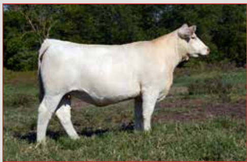
WC MICHELLE 2199 P-DAUGHTER OF LOT 67