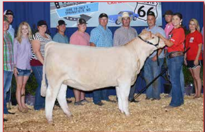
RF MS STEALTH 557