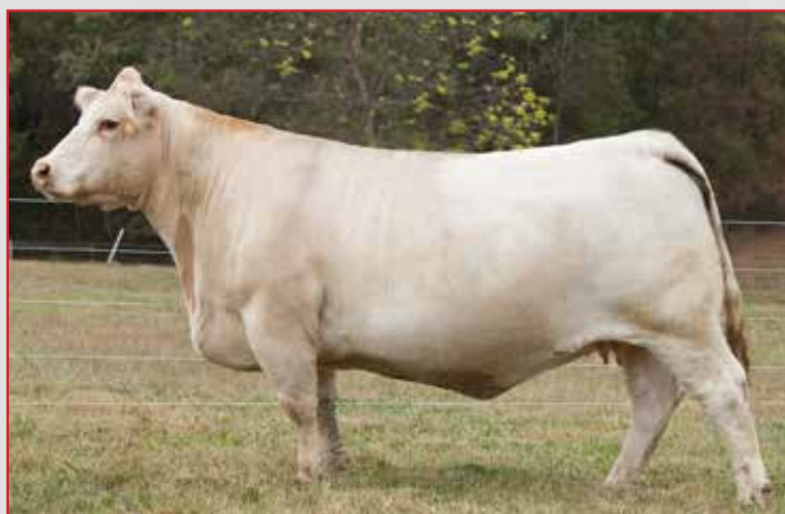
CREEK CUT GRETA-DAM OF LOT 14