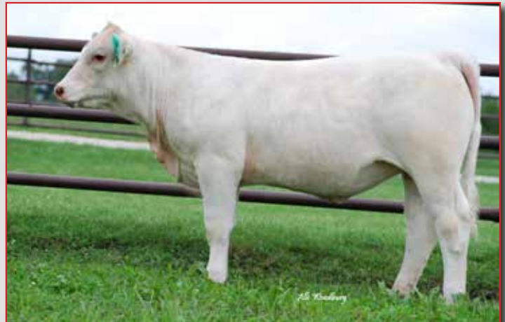
PICTURE OF FULL SISTER TO THIS MATING