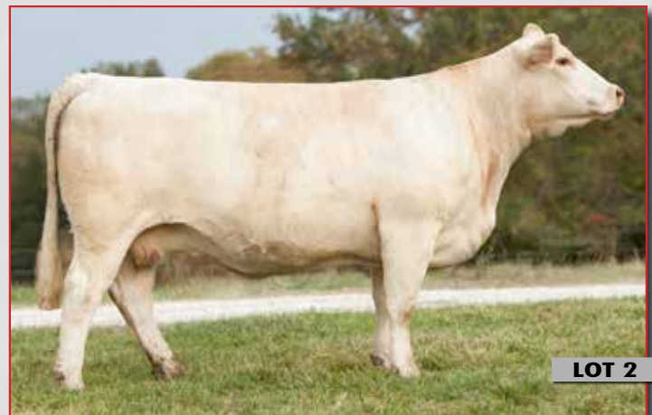
M&M MS STEALTH 7515 PLD ET