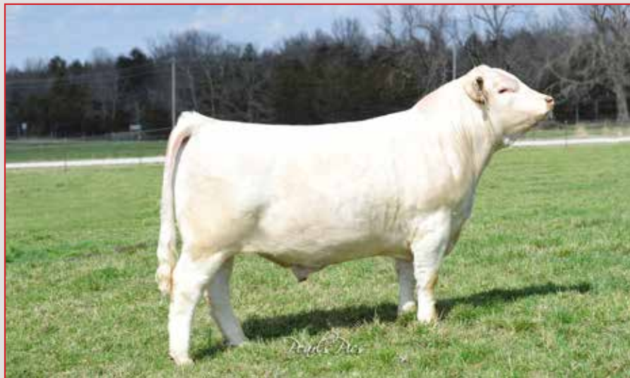
WC DOUBLETREE 2009 P-AI SERVICE SIRE FOR LOTS 37, 38, 40 & 41