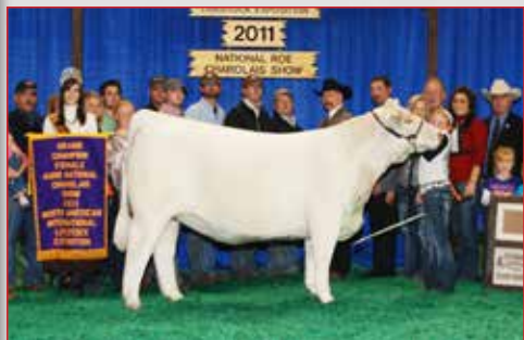
FULL SISTER TO LOT 16