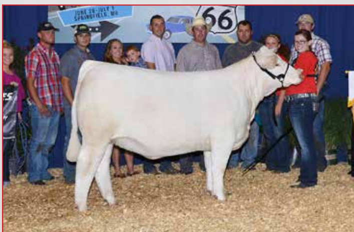
FULL SISTER TO LOT 16