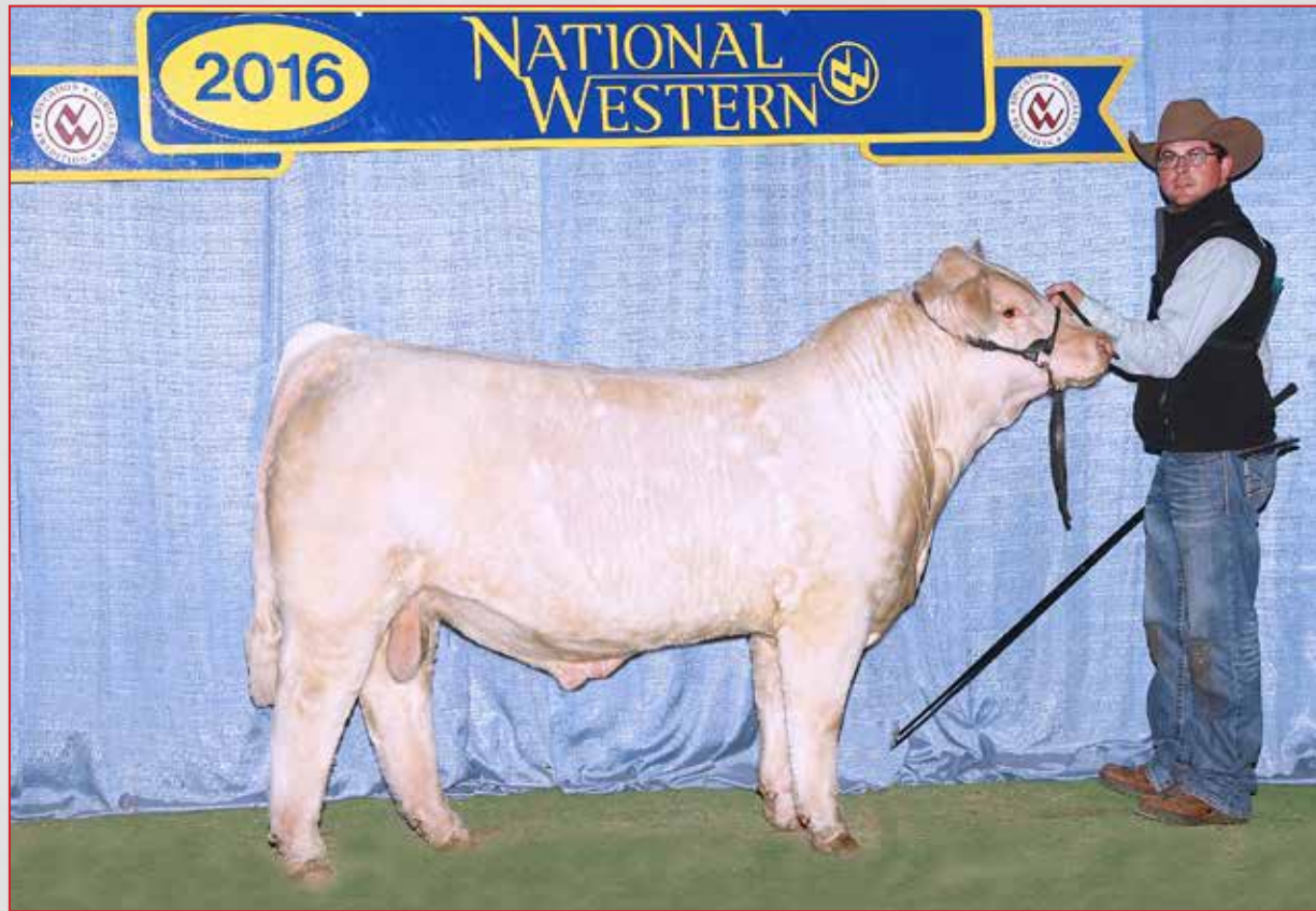
RF BOCEPHUS 5027-SON OF LOT 2