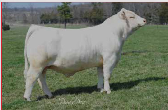
WC BENELLI 2134 P ET-SIRE OF LOTS 38, 39 & 40