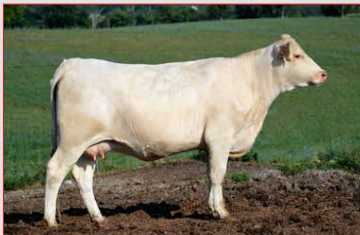
DAM OF LOT 30 - AS A BRED HEIFER