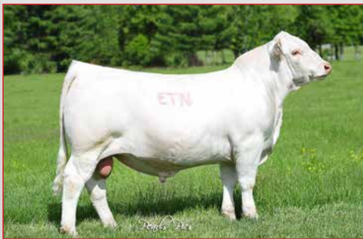
EATONS CROSS FIRE-SERVICE SIRE & CALF SIRE FOR LOTS 48, 49 & 50