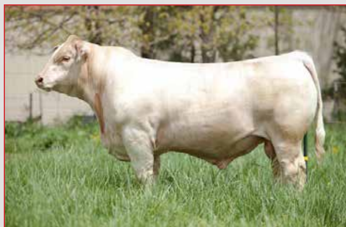
LT INVESTMENT 2292 PLD – SIRE OF LOTS 22 THROUGH 25