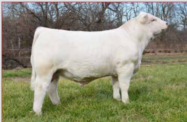
WC MILESTONE 5223-AI SERVICE SIRE FOR LOTS 45 & 46