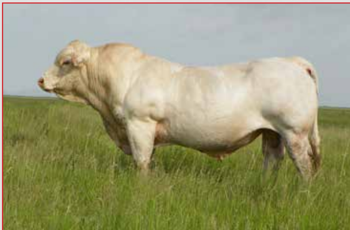
RAILE 2250 T077