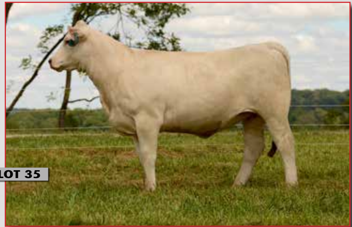
WIA RF STONERIDGE PLD