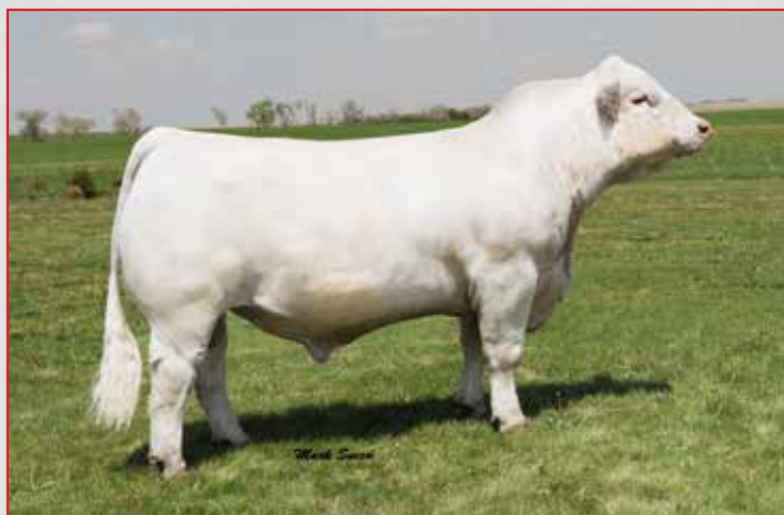
TURTON-SIRE OF LOT 14

Be sure to watch for new pictures and videos of the Open Show Heifer Prospects near the sale date approximately October 10th, on the Ridder Farms website— www.RidderFarms.com