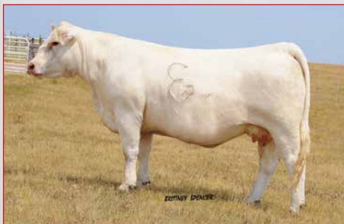
3G COWGIRL XQUISITE-DAM OF LOT 11