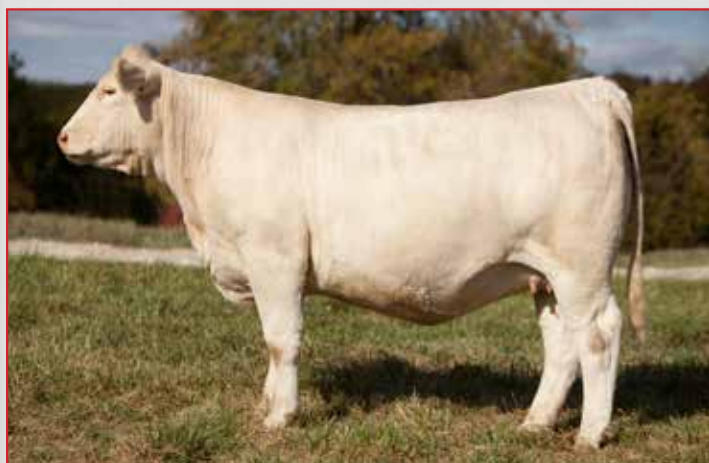
RF MS DUCHESS 202-DAM OF LOT 4