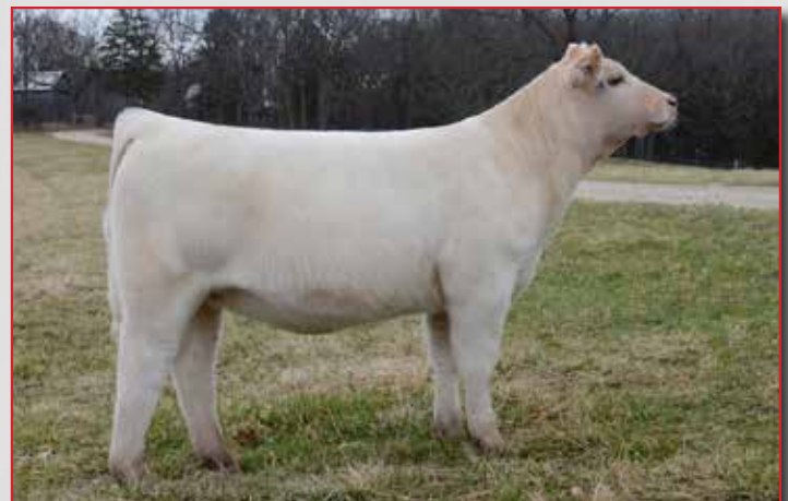
RF MS STEALTH 557