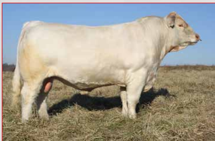
WH TRIPLE PLAY 201 PLD-SIRE OF LOT 42