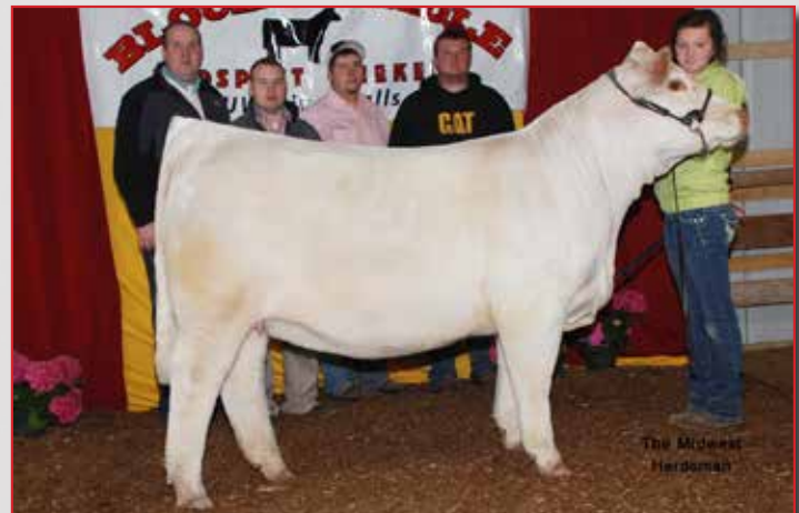
WDZ SKITTLES PLD ET