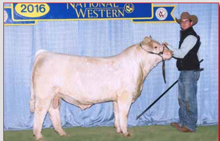
RF BOCEPHUS 5027