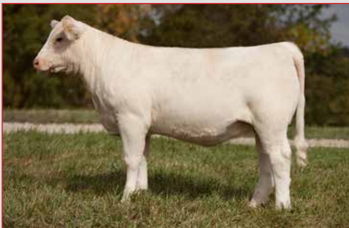
RF MS STEALTH 46A-DAUGHTER OF LOT 2

• 7515 has been our long-standing donor that continues to have her calves at the top of every sale we have! She is sired by the Reserve National Champion DR Stealth and out of a daughter of the great Duchess 433 donor that M&M Charolais has had a lot of success with. We could go on for days about how great this donor is! Her WW, YW, Milk, Maternal and Scrotal EPDs are outstanding along with great carcass EPDs. In last years sale she had one of the top selling open females at $9,000. In 2014 a bred heifer sold for $7,000. In 2013 an open heifer sells for $8,500 just after she had been reserve in the calf division at the Royal. In 2012 one of the top heifers to sell goes on to be National Reserve Junior Calf Champion at Ft. Worth! We sold a son of hers last fall for $8,500. A son of hers RF Bocephus is currently your National Bull Calf Champion in Louisville as well as Bull Calf Champion at the Royal and in Denver. Another son by Ledger will highlight our Cattlemen's Kind Bull Sale in Oklahoma this fall. Her last 11 calves to sell at auction in the last few years have averaged $6,528! This cow has clicked very well with whatever sire we chose to use on her. 7515 has always been a successful embryo producer. She will make you money! Trust us!