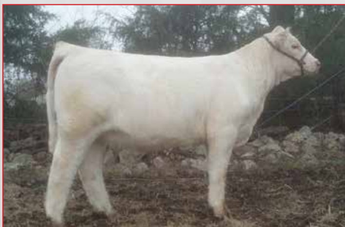
DAUGHTER OF LOT 48