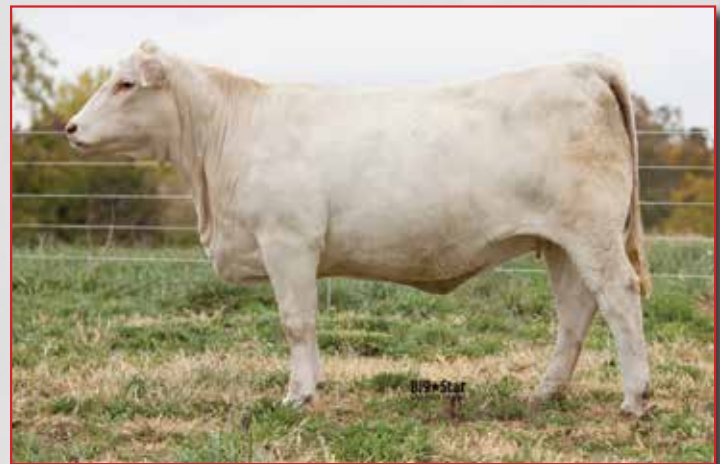
RF MS NANCY 119-$7,500 DAUGHTER