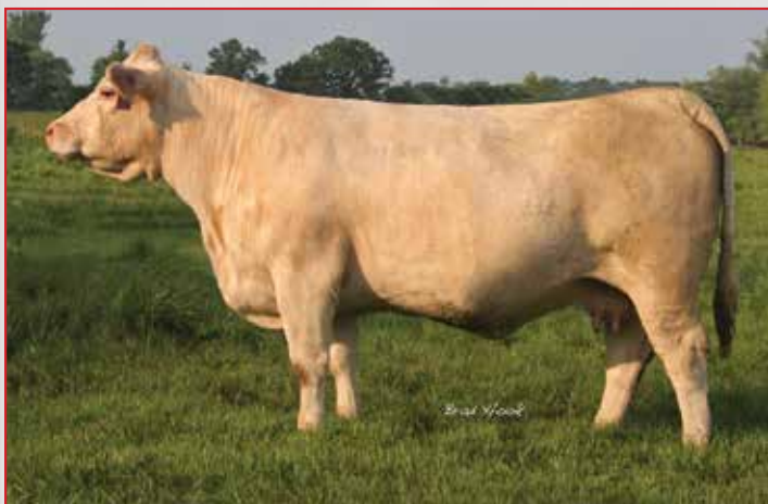
ACE MS BUD 2419-DAM OF LOT 15