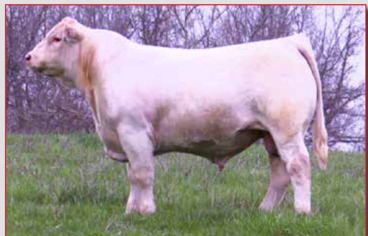
RF LEDGER 439