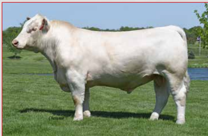
SUMMIT BOJANGLES B09-SIRE OF LOT 45A