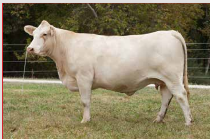
AC MS SOUTHERN SPICE PET-DAM OF LOT 21