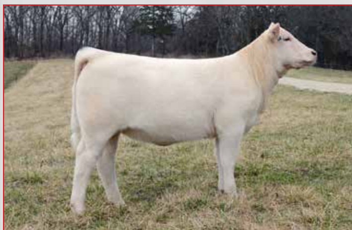
RF MS NANCY 553-FULL SISTER TO LOT 8