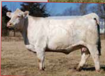
BOW DAK Wind 008K Polled - Dam of Lot 51