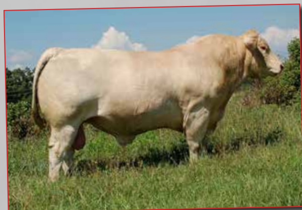
Cooley Royce 1107T39

E 4 ET's (three bulls & one heifer) Sparrows Sanchez 715T x Bar5 Miss Cigar 3070 P (EF1067986) Sanchez-the sire of Diablo & Encore and #3070 a Cigar x Ms Bud 418 donor.