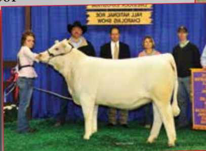
5J Cigarro 924- Maternal sisters to Lots 14A, B & 15

15 5J CIGARRO 1304 03/04/2013 EF1170656 POLLED