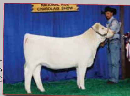
CCR Cici 53 P - Full sister to Lots 12A, B & C