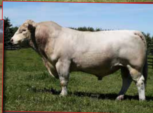
Sparrows Sanchez 715T