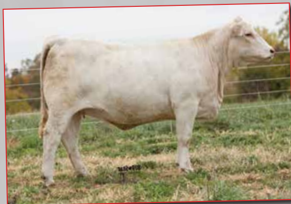
RF Ms Nancy 119 P - maternal sister from 2011 sale