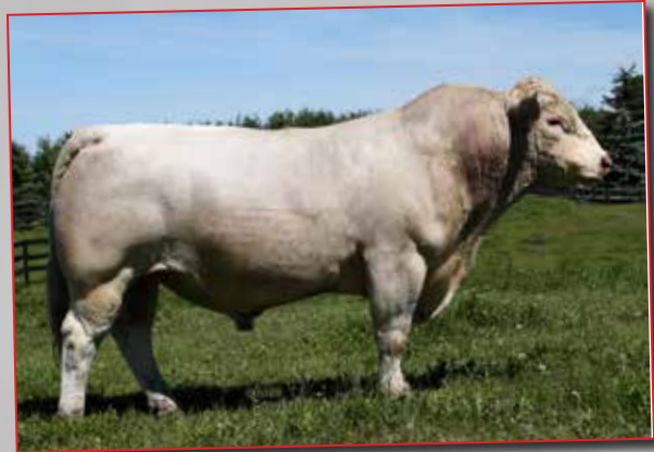
Sparrows Sanchez 715T - Sire of Lot 21