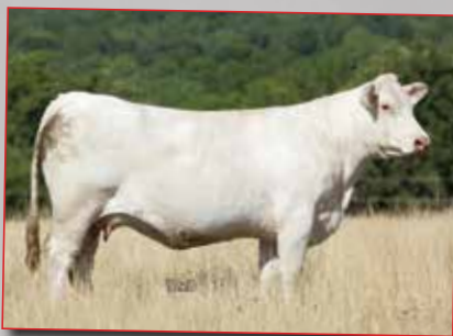
5J Cigarro 925