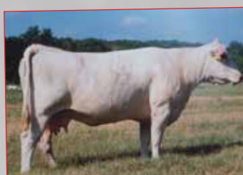
RC Ms Bud 418