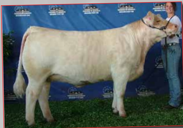
RF Miss Bonnie 539 P- Dam of Lot 17