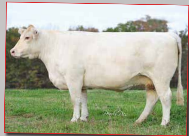
M&M Ms Stealth 7515 Pld ET - Dam of Lot 3 embryos