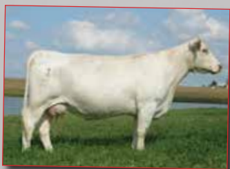
SCC Lady Mac K118