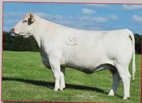
SCR Ms Turbo 7003 - Dam of Lots 13A, B & C

Presented by Ridder Farms, Wright Charolais & Wild Indian Acres