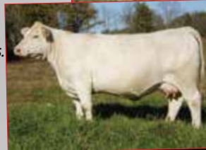
OW Ashlee 0063 - Dam of Lots 8, 9 & X-Factor