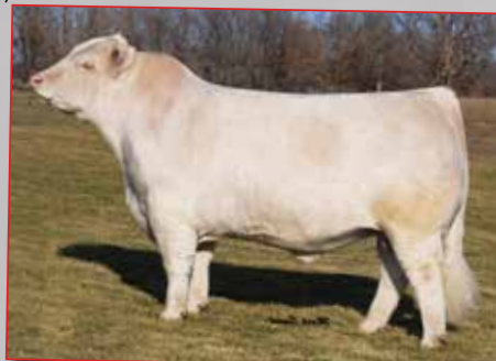
Keys All State 149X