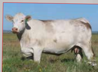
EC Lady Duke 2022