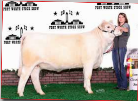
RF Ms Stealth 27515 P - Maternal sister to Lot 1 & 2