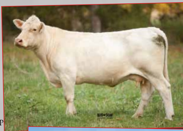
Bar5 Miss Cigar 3070P