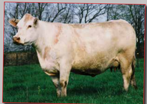
Creek Cut Cigarro 382 - Dam of Lots 14A, B & 15