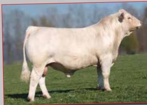
Mead-RF X-Factor G584 P - Sire of Lots 48A, 49A & 50A

Lot 48A -Polled bull calf #348, born: 9-18-13, BW: 78 lbs. sired by Mead-RF X-Factor G584 P. Presented by Ridder Farms